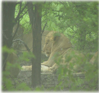
Above: 1999 lion cub with similar swellings on the head and neck

Madikwe guests encountering the Dipelo pride a month or so back would have been excused for thinking that the odd looking Timodiso cub was some new Big Face sub-species of lion.