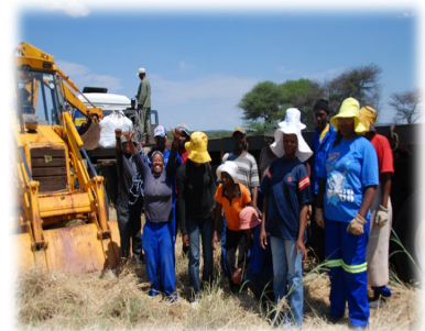
The Mmasebedule community load their first 40 tons of glass!