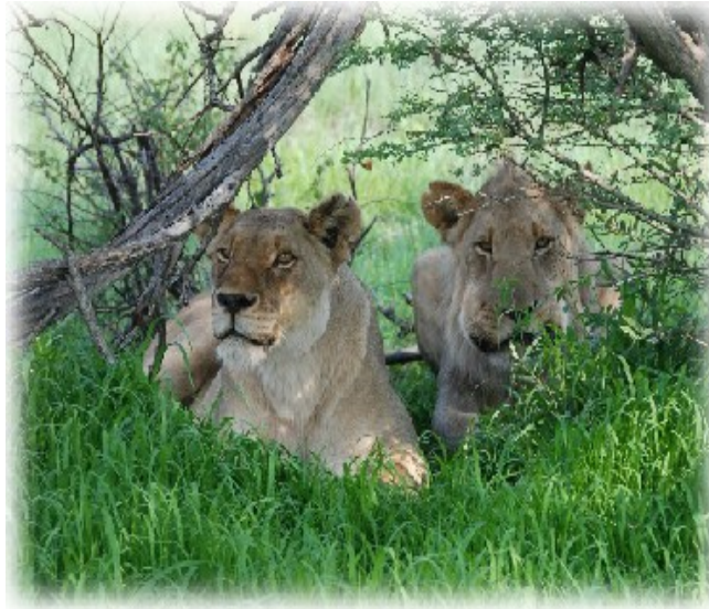
Left: The Timodiso male with his mother when his face was severely swollen